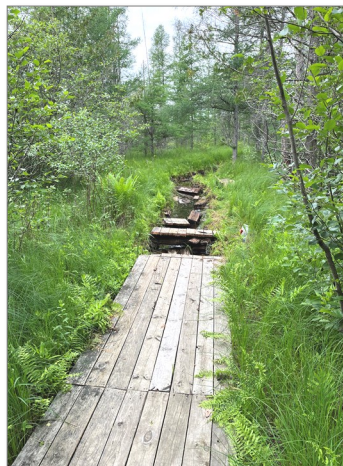
Boardwalk during demolition

Funding for the boardwalk’s replacement was thanks to grants from the State of Michigan and many generous donations. The completion of this significant project will allow visitors to safely enjoy the Grass River Natural Area for many years.