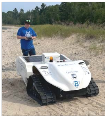
BeBot in action

We hope to provide more information about the BeBot in September.